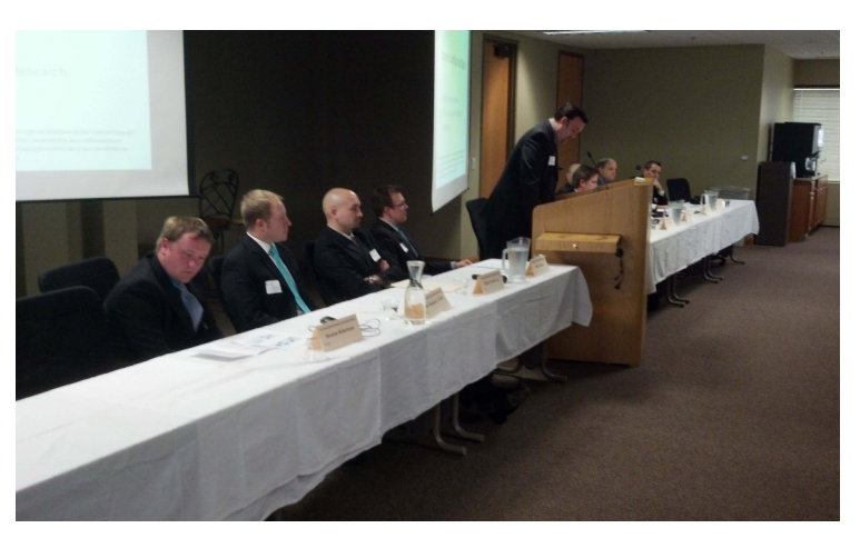
The panelists for the 2013 Year-in-Review Symposium.